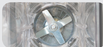
Stainless Steel Blade

ON/OFF SWITCH VARIABLE SPEED DIAL HIGH/LOW PULSE